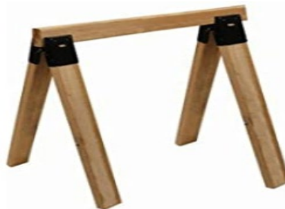
SHORT SAW HORSE