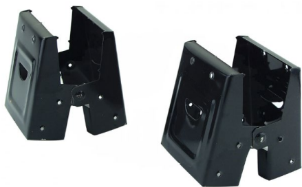
SAW HORSE BRACKETS (FOLDING)